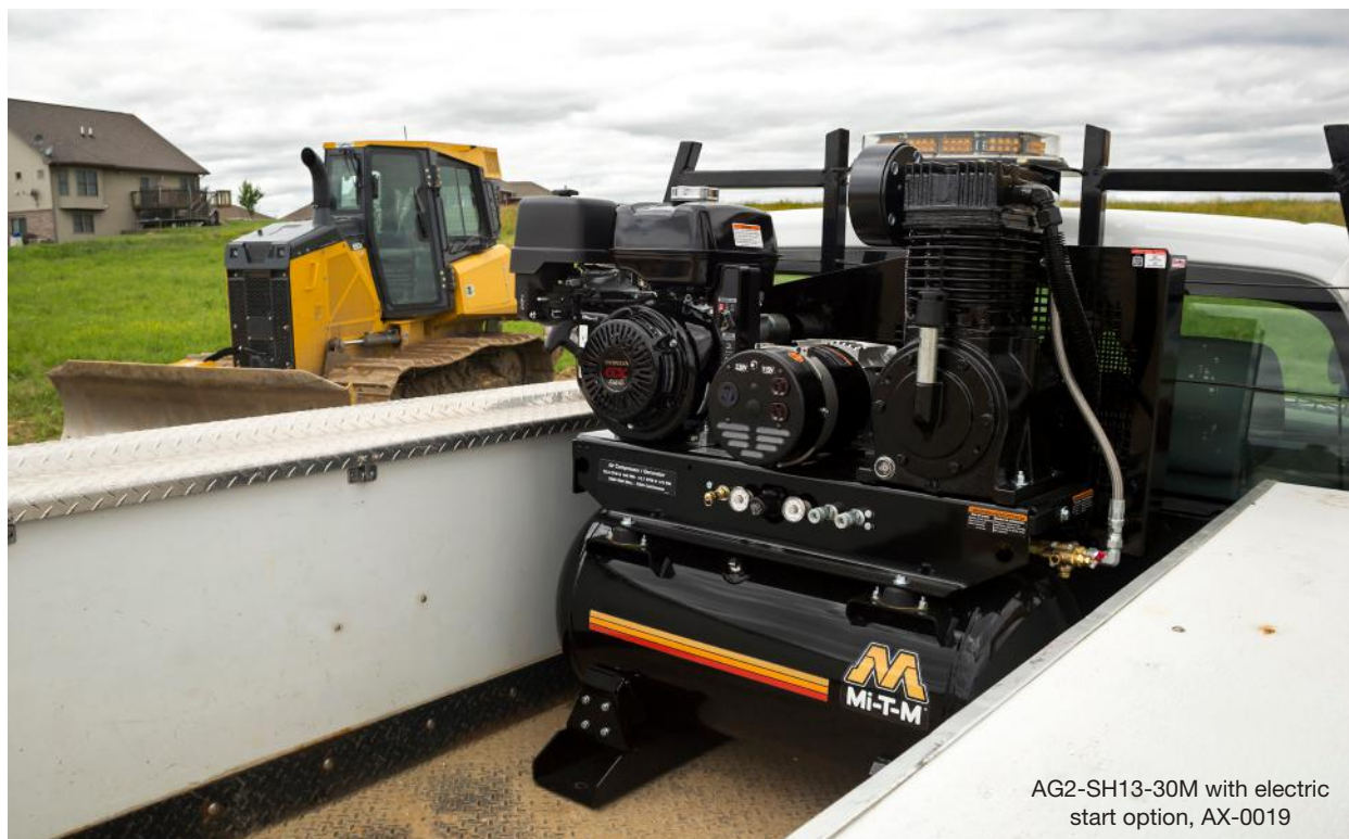
AG2-SH13-30M with electric start option, AX-0019

WARNING: Cancer and Reproductive Harm - www.P65Warnings.ca.gov .